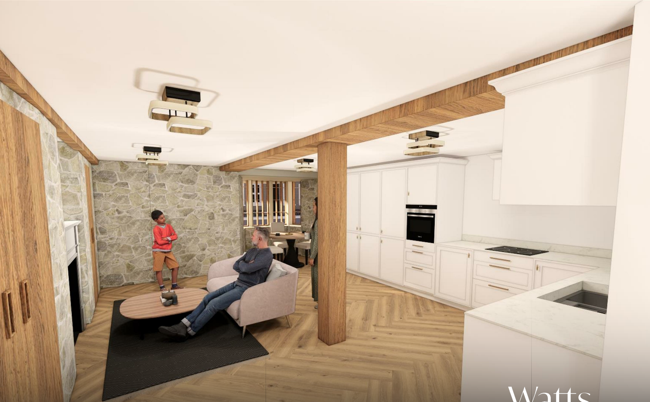
Apartment 1 The Market Place, High Street Cowbridge, CF71 7AH